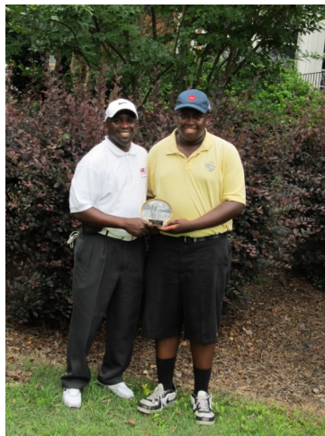
Longest Drive Winner