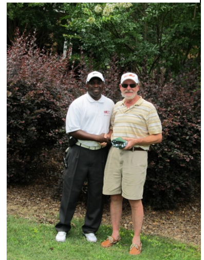
Closest to the Pin Winner