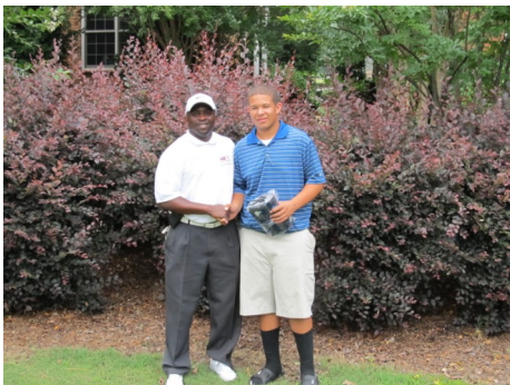
Closest to the Pin Winner

2011 JKC Golf Tournament Closest to the Pin , Longest drive and 1st Tee winners: