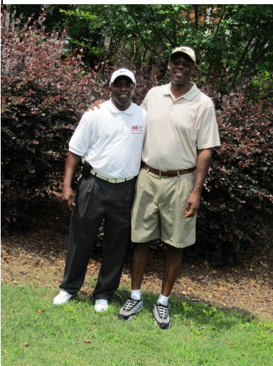
Closest to the Pin Winner