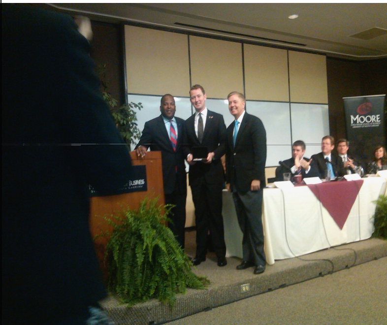
Mayor Steve Benjamin presented the United Kingdom Minister of the State in Department of Energy & Climate Change with the key to the city of Columbia.