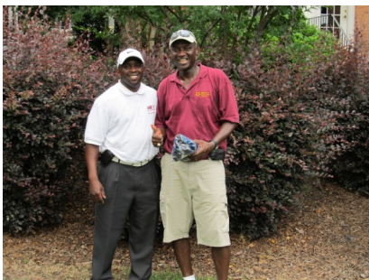
Closest to the Pin