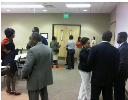
SCCAABE Members taking a moment to network after the General Membership meeting held on 4.7.2011.

For more information on Columbia, SC Cares, visit: http://columbia.caresmentoring.org/