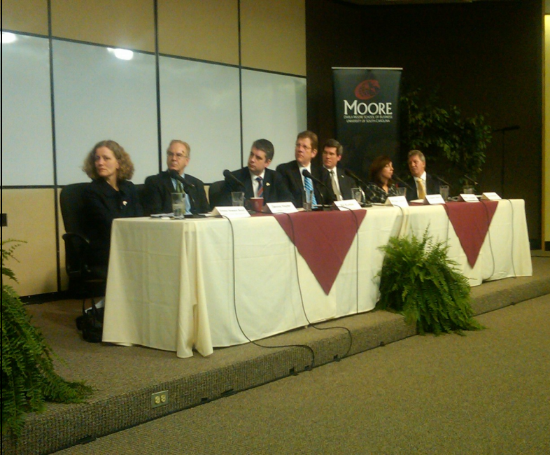
United Kingdom and South Carolina Panelists