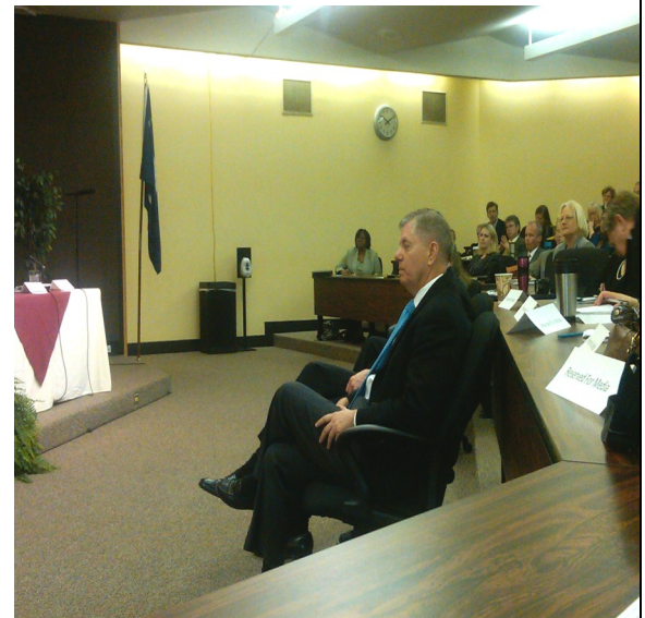
Senator (SC) Lindsey Graham giving some riveting points on the green energy agenda for the state of South Carolina.