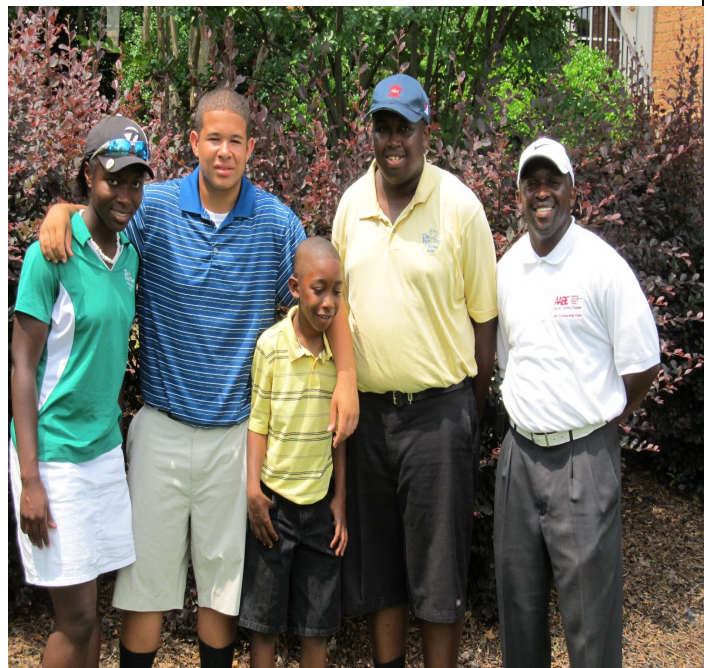
1st Tee Team