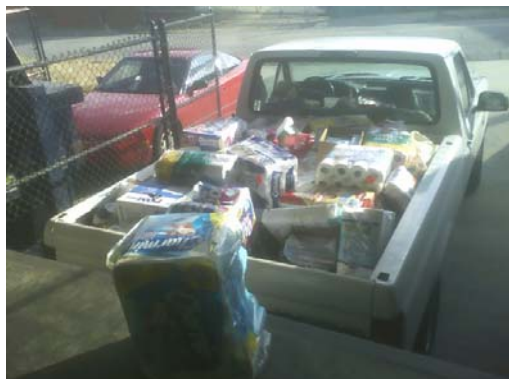
We collected two truckloads!