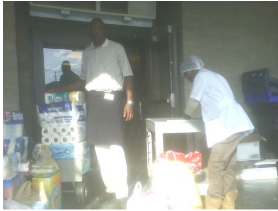
My Sister's House employees unloading donations.